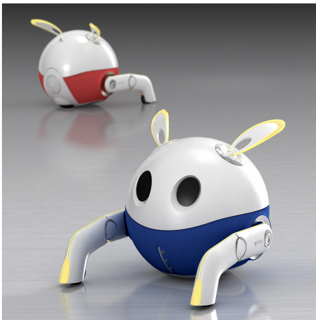
Figure 3: Concept robot image developed in accordance with user preferences

Finally, we developed a robot for children in accordance with the set of guidelines developed. [Figure 3] shows a rendering image of the robot. The guidelines provided an effective perspective for resolving traditional design conflicts in deciding on form, material, and color.