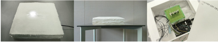
Figure 1 the simulation model for multi-sensory communication _ tactuaLight [text] #1