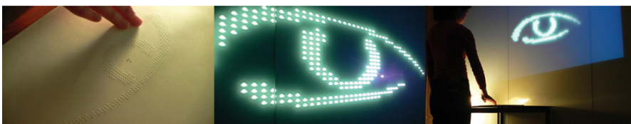
Figure 2 the simulation model for multi-sensory communication _ tactuaLight [image] #2