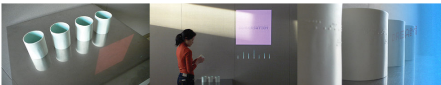
Figure 3 : the simulation model for multi-sensory communication _ tactuaListening [sound] #3