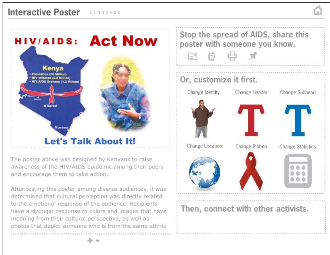
Figure 6 HIV/AIDS interactive poster.

Figure 6 below shows the next iteration of the interactive poster: