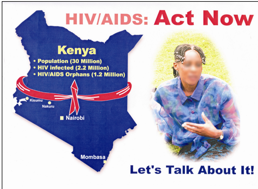
Figure 1 Example of campaign poster designed by Kenyans in a summer participatory design workshop. [The face of the person has been disguised at the subject's request. It was not censored in the local version of the design.]

The participatory design workshop was conducted in a community resource center in Kenya with a US graduate student—a native Kenyan studying abroad in the United States. US educators situated in the United States participated in the workshop by way of a virtual design studio constructed out of existing instructional and communication technologies for synchronous and asynchronous dialogue and interaction. The outcome of the workshop is Figure 1, a culturally-specific graphic.